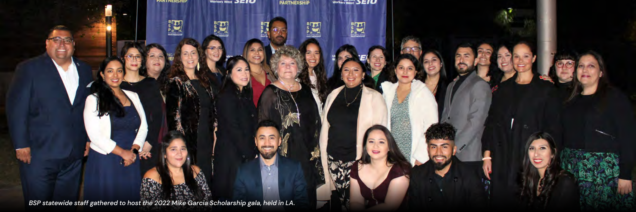
BSP statewide staff gathered to host the 2022 Mike Garcia Scholarship gala, held in LA.