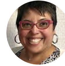
Lilia Garcia-Brower CA Department of Industrial Relations California Labor Commissioner