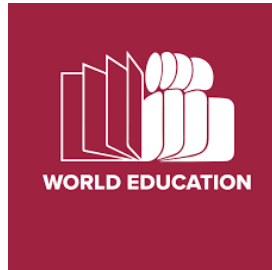
WORLD EDUCATION Peer Digital Navigators Key to Digital Equity